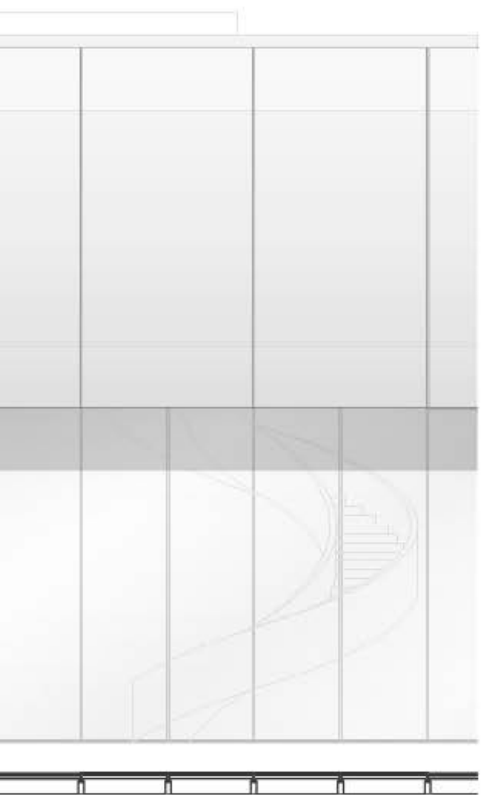
Facade section + elevation